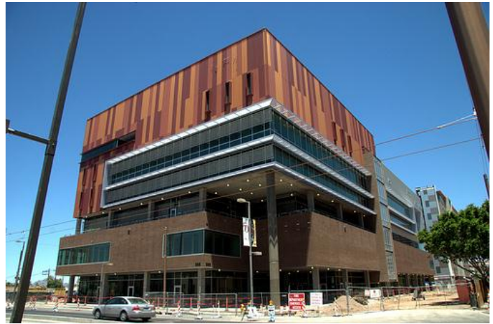
The Walter Cronkite School of Journalism at Arizona State University

As the media industry evolves to meet the challenges of the emerging digitally-networked era, so too are journalism schools. Democracy and healthy local communities require this evolution. As the media industry reshapes itself, a tremendous opportunity emerges for America’s journalism programs. Neither news organizations nor journalism programs will disappear, but both must rethink their missions, particularly now that many more people can be journalists (at least, on an occasional basis) and many more people produce media than ever before.