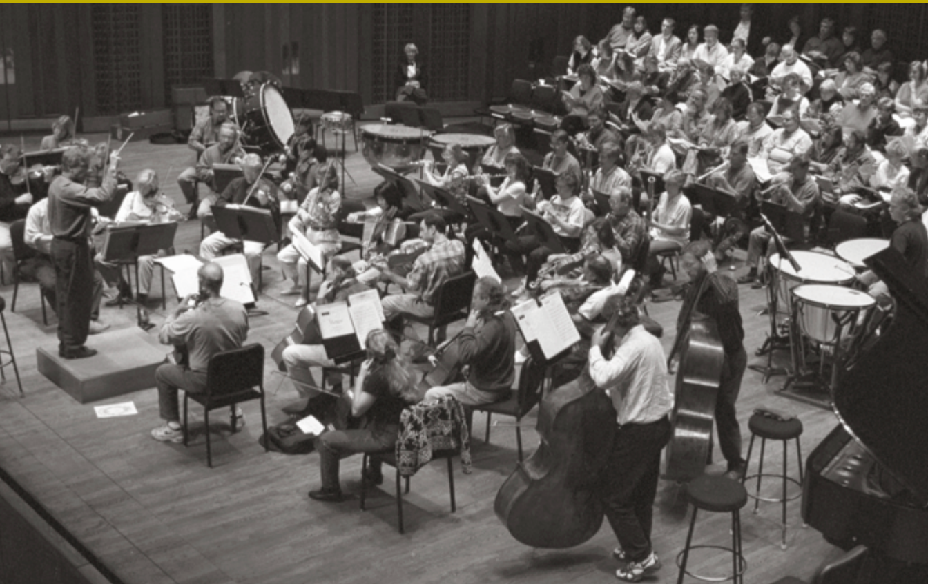
Hugh Wolff rehearsed the Saint Paul Chamber Orchestra in 1998 as students in the adult education series, Musical U, followed the score on stage.