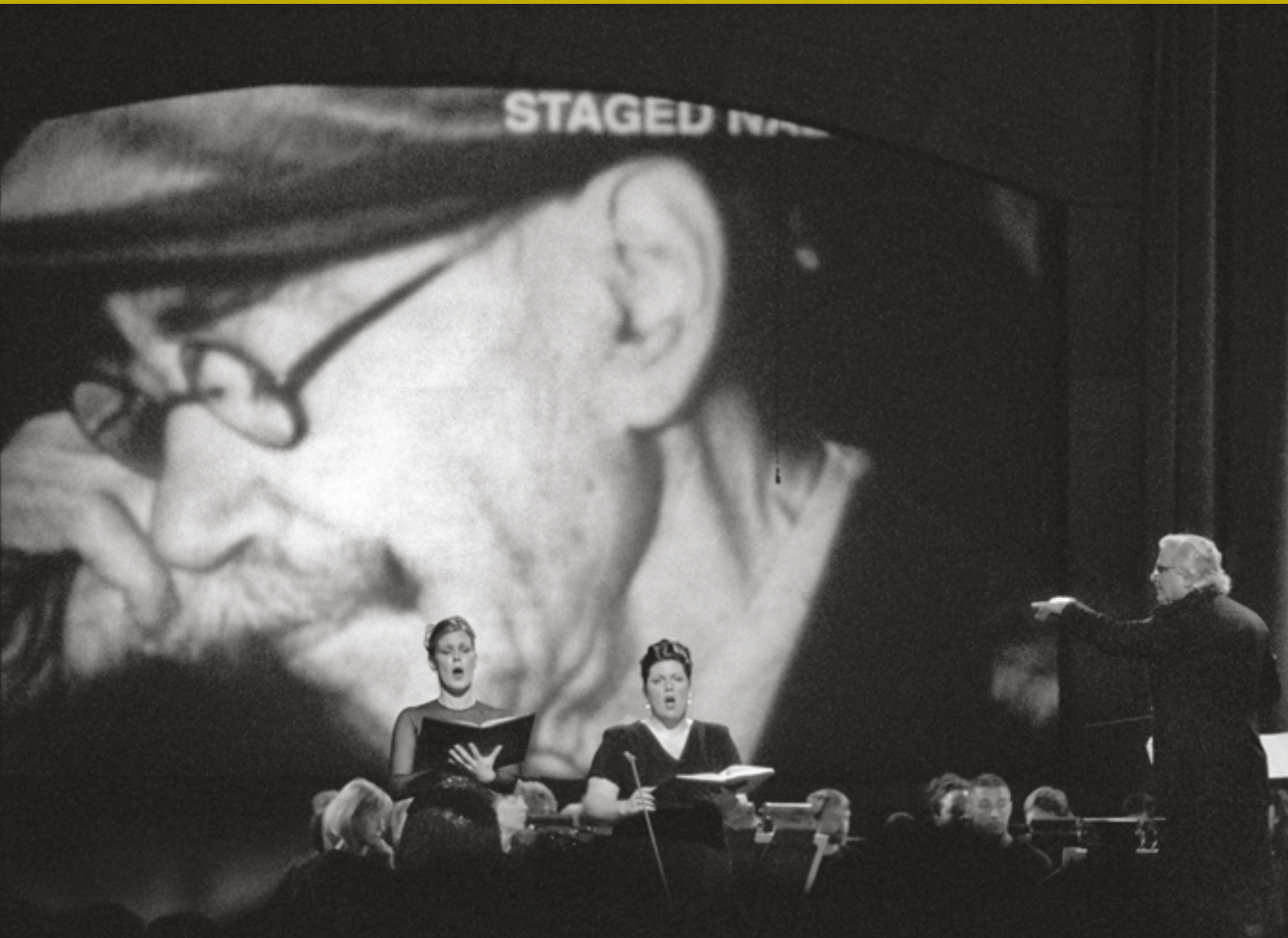
The Oregon Symphony and the Portland Opera Chorus performed Defiant Requiem; the presentation was recorded and broadcast on PBS in August 2003.