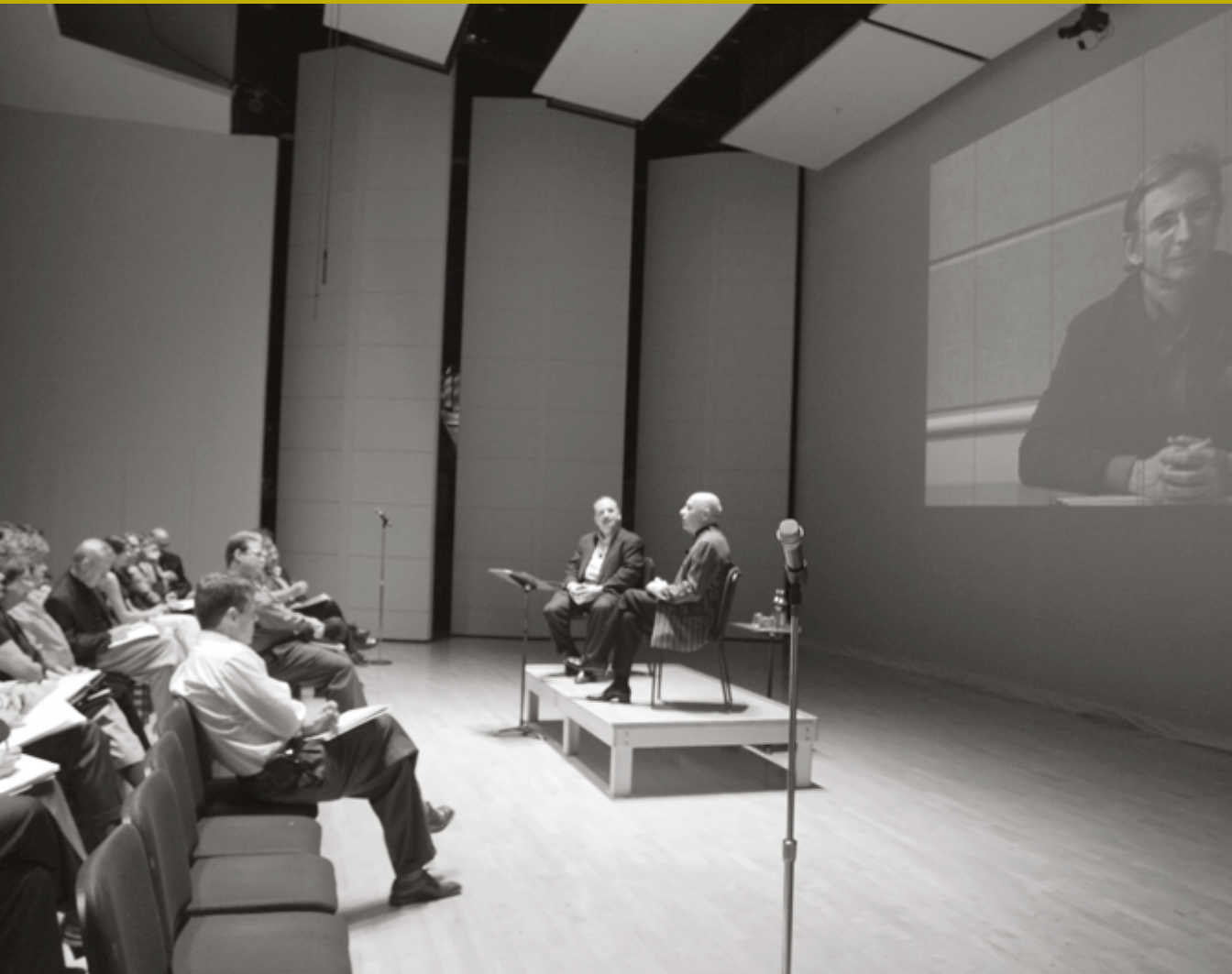
New World Symphony music director Michael Tilson Thomas, looming over the stage, spoke via Internet2 technology at the Magic of Music retreat in Miami Beach in January 2005.