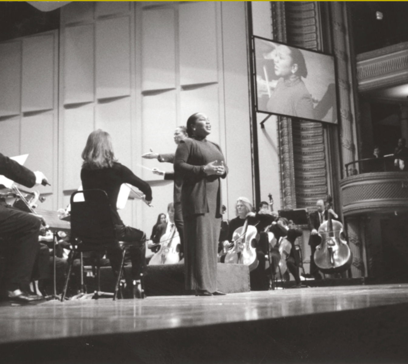
In 1998, the Louisiana Philharmonic Orchestra's Connections series was enhanced by onstage video.