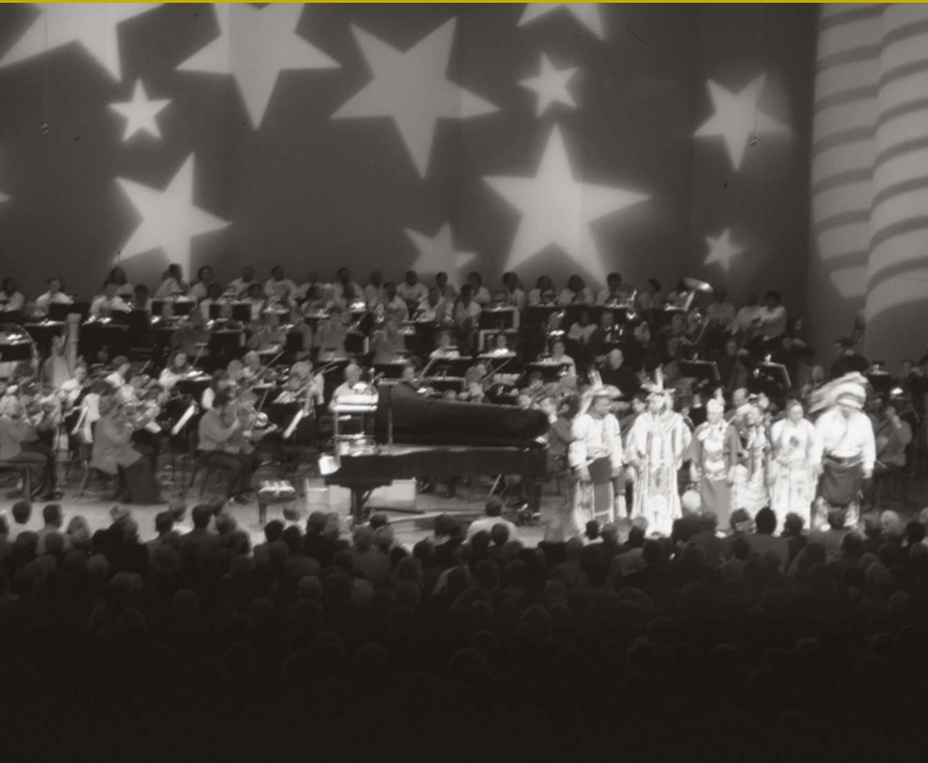
The Wichita Symphony performed as part of its Sound Waves series in November 2003.