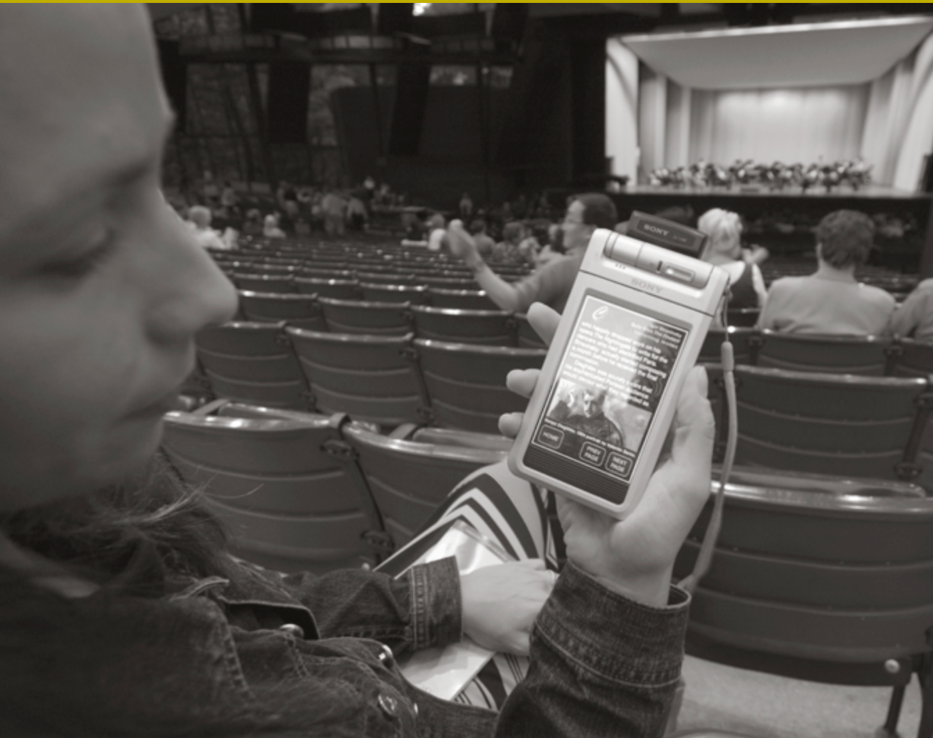
An audience member held a Concert Companion PDA before a live test in Saratoga, N.Y.