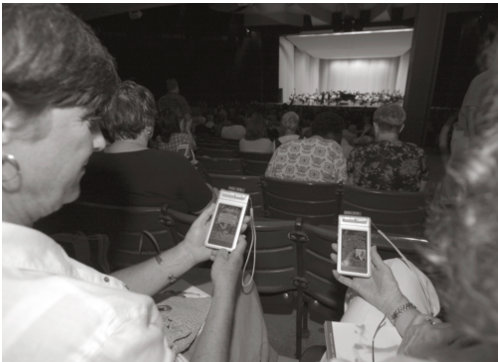
The Concert Companion PDA was developed as part of the Magic of Music by the Kansas City Symphony.