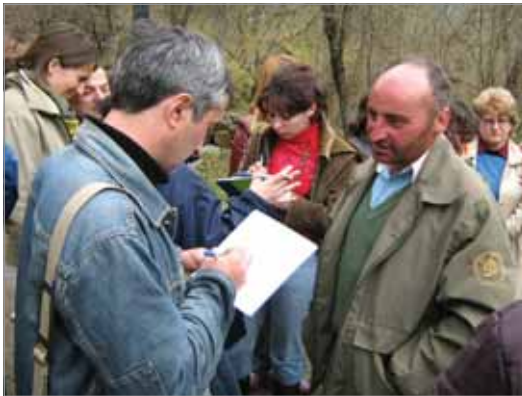
The International Center for Journalists environmental reporting workshop in Georgia